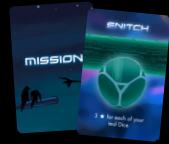
40 x 3 Decks of Mission Cards (English, French & German)