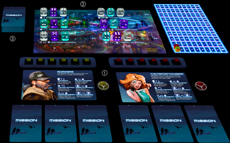
Example of a setup for 2 players

Once all Agents has been deployed, the Player with the most Victory Points (★) from Dice resources, Neighbourhoods and Missions wins the game!