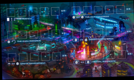
1 x City Board