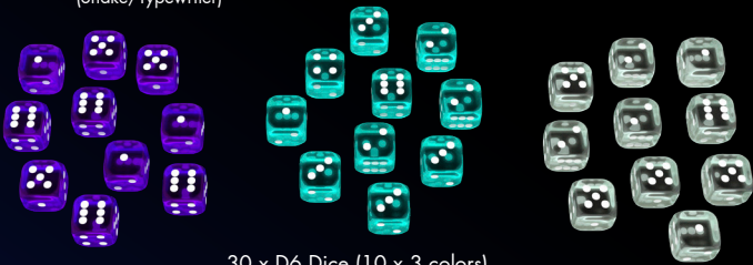
30 x D6 Dice (10 x 3 colors)