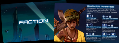
10 x 2 Decks of Faction Cards (English, French/German)