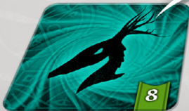
Face-down creature token

Flip all creatures on the board so that they are face-up.