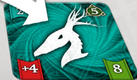
Face-up creature token